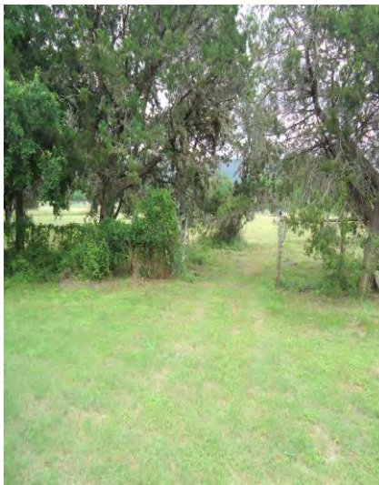
REAL ESTATE IS OUR BUSINESS..... OUR ONLY BUSINESS!